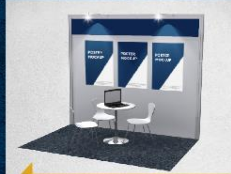
Exhibit Space 3x3 sq.m

Not yet include registration fee 250 USD & VAT 7%